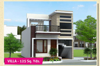
VILLA - 125 Sq. Yds.