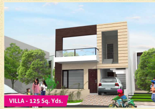
VILLA - 125 Sq. Yds.