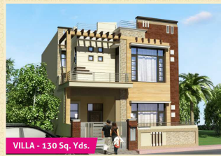
VILLA - 130 Sq. Yds.