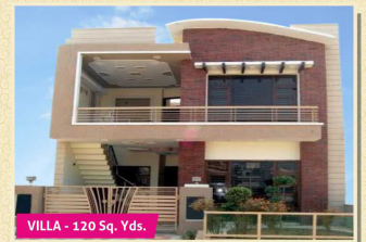
VILLA - 120 Sq. Yds.