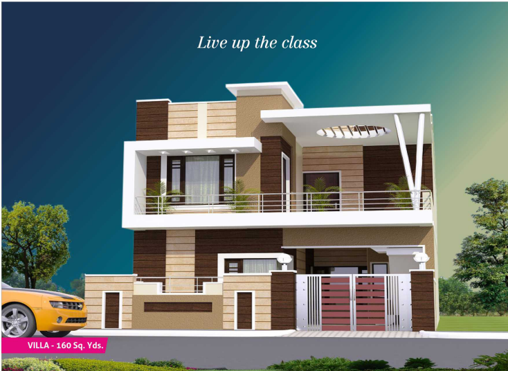
VILLA - 160 Sq. Yds.